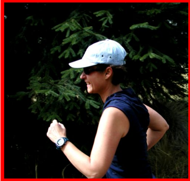
Figure out what makes you more comfortable. You have choices when your period rolls around, and you don't need to just do whatever your mother initially taught you (especially since a lot has probably changed since you first had your period). Whether you choose tampons or pads, the main thing is to make sure that you are personally comfortable with whatever you choose. Don't wear pads if you feel disgusting and feel like you're wearing a diaper. On the other hand, don't wear tampons if you get a little freaked

out at the idea of sticking something inside you and holding in all the blood that is trying to leave your body. As long as you are comfortable with the choice you make (although most women know it's hard to be comfortable during a period anyhow) then you can also make sure that for health's sake you are changing your pad or tampon frequently. If you don't change your pad frequently you might wind up with a bad rash, not to mention that it's simply bad hygiene to walk around with a pad all day. As most women know, bad hygiene is only a hop, skip, and a jump away from illness, so you don't want to open the door to getting sick like that. Tampons should also be changed frequently because you don't want to risk winding up with Toxic Shock Syndrome, which is quite rare but still a possibility. If you suffer from cramps during your period, you should make sure to try out a variety of pain relievers to find the one that works best for you. Some women do fine with regular pain relievers, but there is a wide variety of pain relievers manufactured specifically for problems with menstrual cycles. You can choose from acetaminophen or ibuprofen based pain relievers, and many of them include other ingredients to lessen bloating and help with energy levels. The important thing to remember when it comes to using pain relievers for period